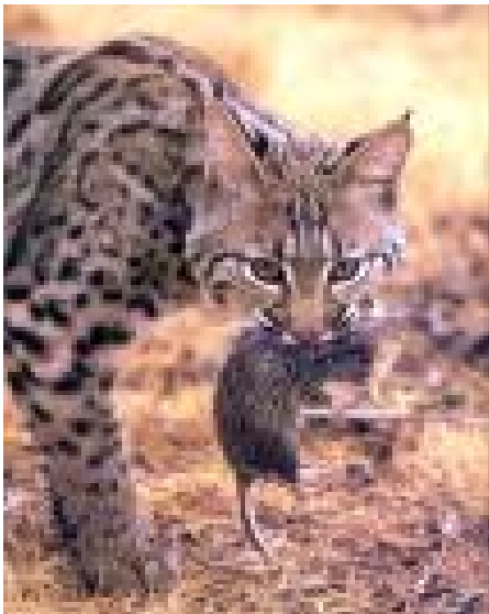
Bobcat eating a rabbit.

Despite its pussycat appearance when seen in repose, the Bobcat is quite fierce and is equipped to kill animals as large as deer. When living near a ranch, it may take lambs, poultry and even young pigs. However, food habit studies have shown Bobcats subsist on a diet of rabbits, ground squirrels, mice, pocket gophers and wood rats. Quail have been found in bobcat stomachs, but predation by bobcats does not harm healthy game populations.